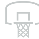
ATHLETIC BOOSTER CLUB (ABC)

Each day, there are volunteer opportunities where you can serve and celebrate the activities that mean the most to your family. Our three parent clubs organize many of our volunteer opportunities.