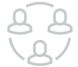
PARENT TEACHER FELLOWSHIP (PTF)